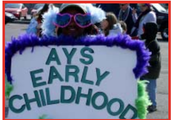
AYS Early Childhood programs joined in the fun of Mardi Gras Mambo.