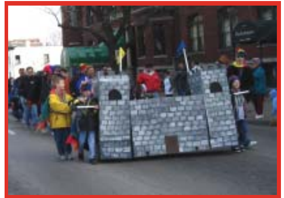
AYS programs from Decatur Township carry their castle float along Mass Ave.

Each program was assigned a business, and each student designed an ad. Selected ads appeared in a special pullout section of The Ledger on May 2. The businesses chose the ads that would appear in the section.