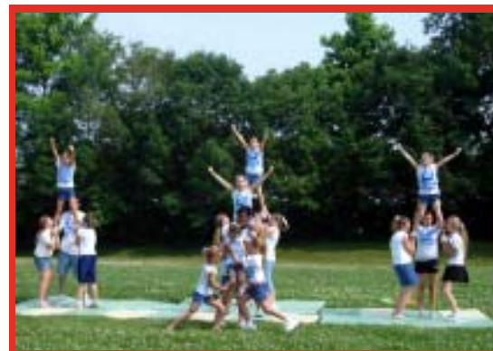
Camp AYS students from Decatur Township perform a cheer routine at AYS Fest.