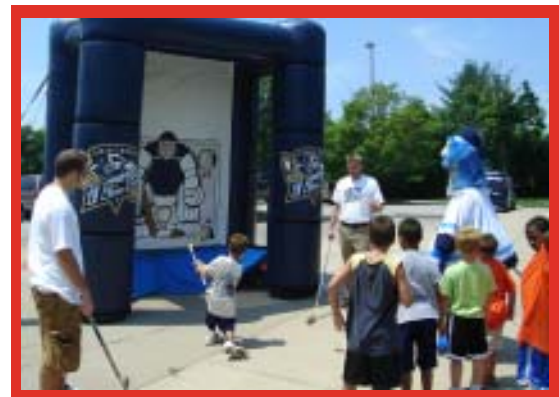
With Big-E-Foot standing by, students take their best shot at the Indianapolis Ice booth at AYS Fest.