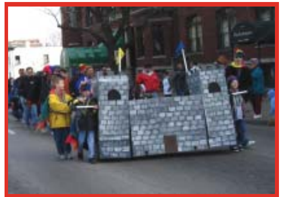
AYS programs from Decatur Township carry their castle float along Mass Ave.

Each program was assigned a business, and each student designed an ad. Selected ads appeared in a special pullout section of The Ledger on May 2. The businesses chose the ads that would appear in the section.