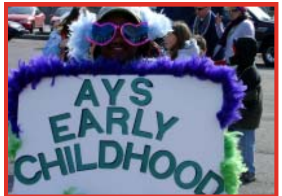
AYS Early Childhood programs joined in the fun of Mardi Gras Mambo.