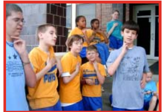
(Top) Students at AYS' St. Thomas Aquinas program check their pulses after a workout.

Jill has provided occupational health support for AYS staff. This role includes providing TB skin tests for staff and volunteers, facilitating pre-placement requirements, providing blood pressure readings and consultation for staff, and providing general wellness resources and referrals for staff.