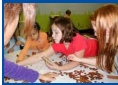
A Community Agency