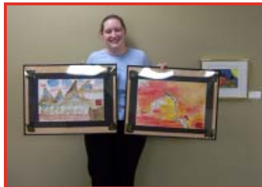
A member of the community purchases AYS artwork on display at Regions Bank.