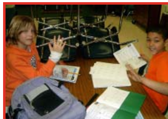
Homework time at Nora Elementary AYS.