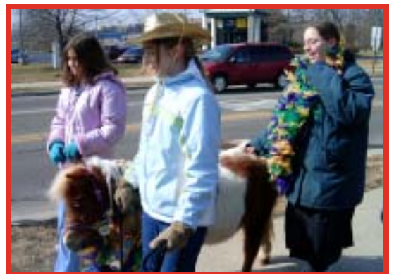
Miniature horses from Agape Therapeutic Riding marched in both the Noblesville and Mass Ave. parades.