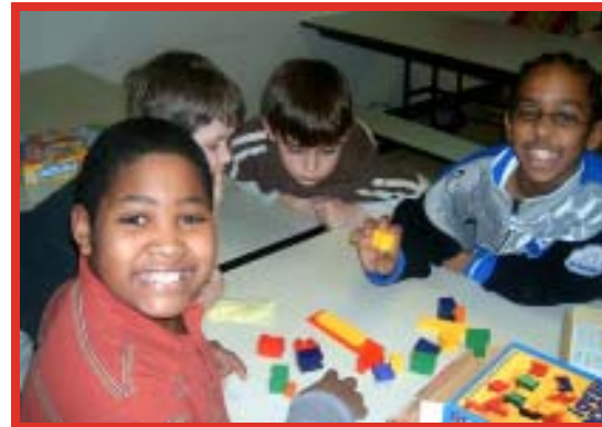
Having fun with friends at AYS' IPS 91 program.

AYS' summer camps provide a safe, fun environment for children and youth throughout the summer. At Camp AYS, students explore a variety of activities. AYS partnered with Skyhawk Sports Camp at three locations this year. Arts Academy provides students with a unique, hands-on opportunity. A number of guest artists, including interns from Herron School of Art, worked with the students throughout the summer. More than 500 children and youth were registered for AYS summer camps.