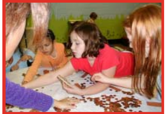
Wrapping “Caring Coins” for those in need.

The Ice, Indiana’s developmental league for hockey players ages 16-20, has implemented a new strategy to give back to the community. By selling Ice game tickets, partnering non-profits can raise money for their agencies. Agencies will receive half of the ticket price for the tickets they sell.